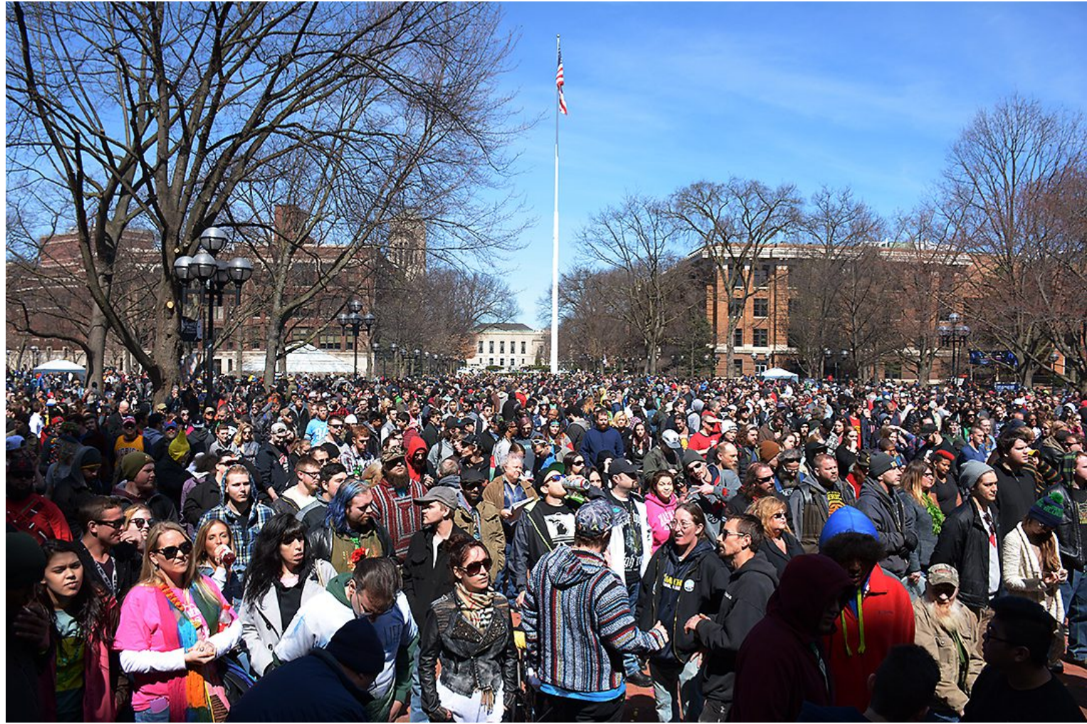
The crowd at the 46th annual Hash Bash has been estimated at 6,000 and 10,000-plus. April 1, 2017, Ann Arbor, Mich.