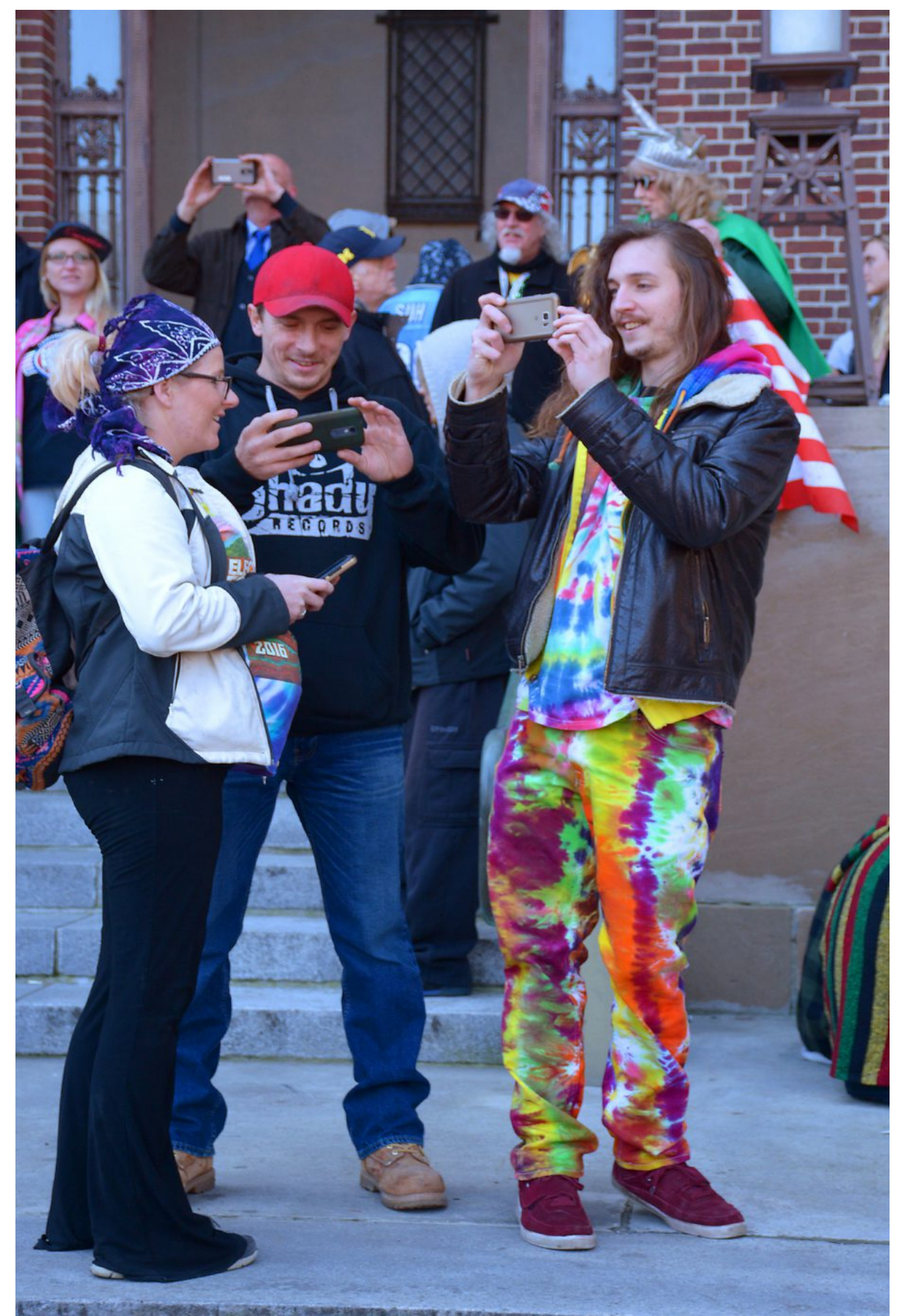
A tie-dye guy photographs the scene from behind the podium. 2017 Hash Bash, April 1, Ann Arbor, Mich.