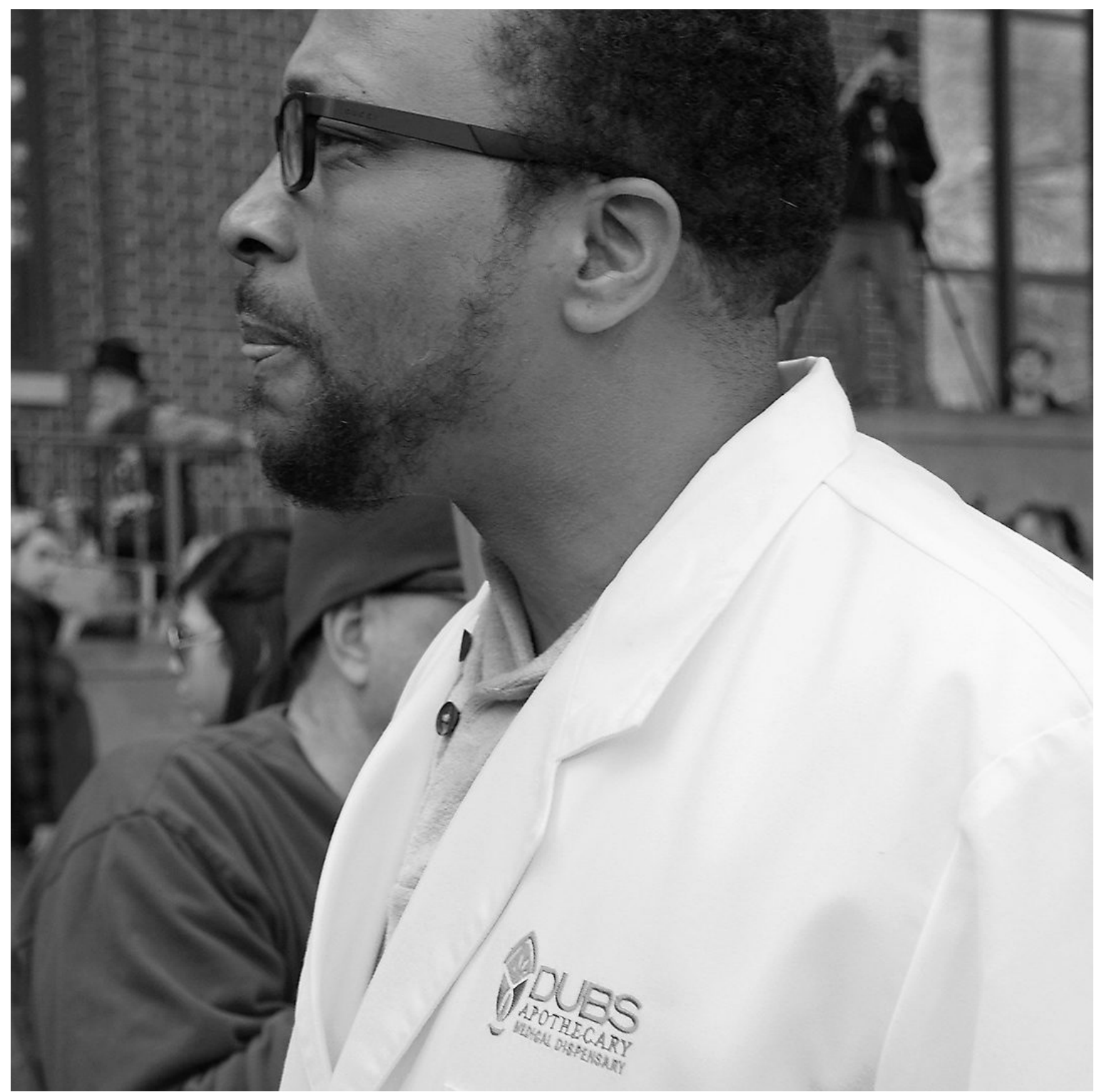
A lab coat guy. 2017 Hash Bash, April 1, Ann Arbor, Mich.